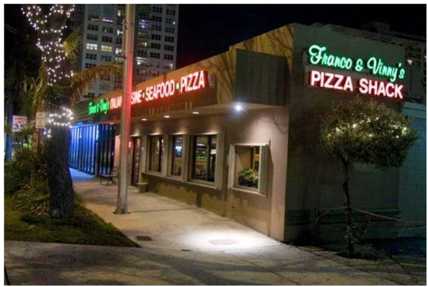
Franco & Vinny's was a Fort Lauderdale beach staple since 1971.

said a bankruptcy filing pre-COVID nearly ended his restaurant but the pandemic was the "final nail in the coffin." 2571 N. Hiatus Road, Cooper City.