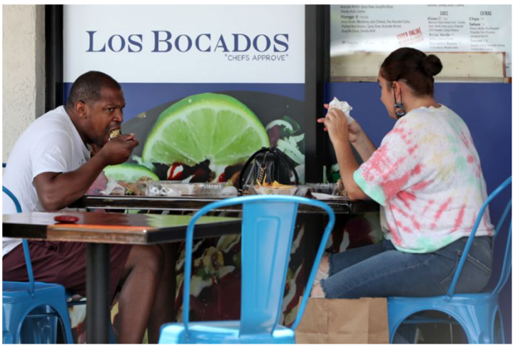
Los Bocados in Parkland, once housed in a Chevron station, has opened its first brick-and-mortar location.